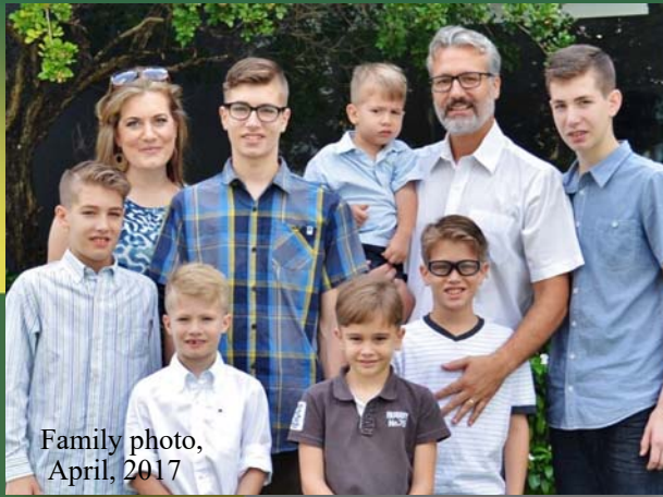
Family photo, April, 2017