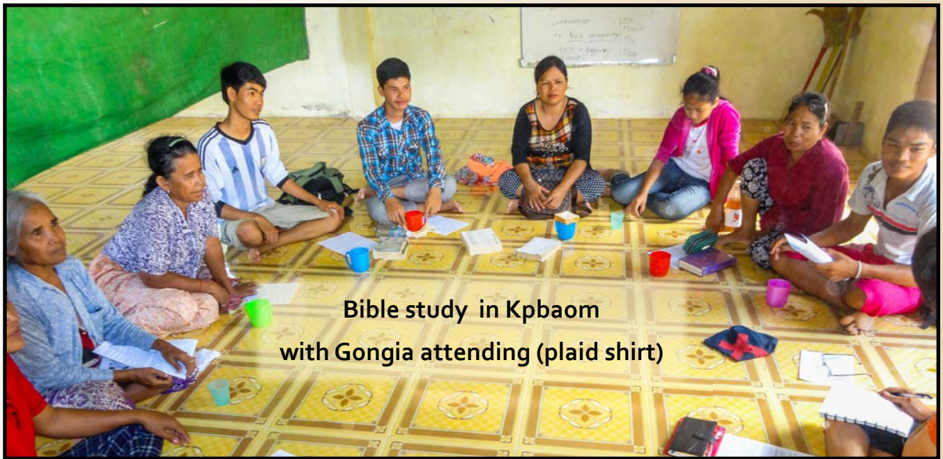
Bible study in Kpbaom with Gongia attending (plaid shirt)